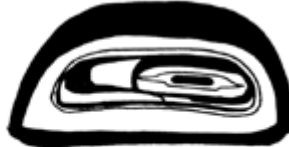
salmon-trout head motif