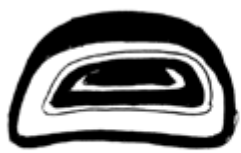
nearly solid ovoid